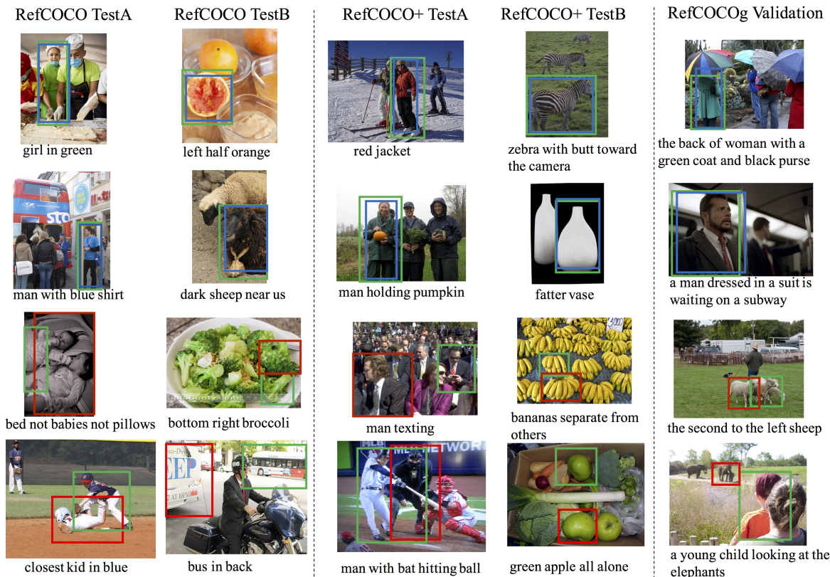
Figure 2: Example comprehension results based on detection. Green box shows the ground-truth region, blue box shows correct comprehension using our “speaker+listener+reinforcer+MMI” model, and red box shows incorrect comprehension. We use top two rows to show some correct comprehensions and bottom two rows to show some incorrect ones.