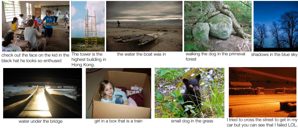
Figure 5: Funny Results: Some particularly funny or poetic results.