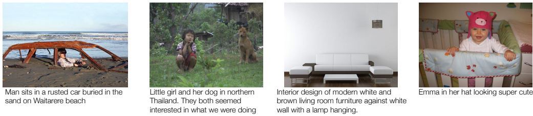
Figure 1: SBU Captioned Photo Dataset: Photographs with user-associated captions from our web-scale captioned photo collection. We collect a large number of photos from Flickr and filter them to produce a data collection containing over 1 million well captioned pictures.

relevant sentence (or sentences) is selected from a document to serve as the document’s summary. Often a variety of features related to document content [23], surface [25], events [19] or feature combinations [28] are used in the selection process to produce sentences that reflect the most significant concepts in the document.