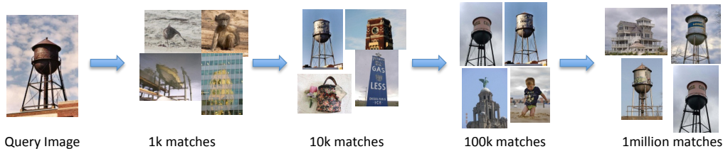
Figure 3: Size Matters: Example matches to a query image for varying data set sizes.

we filter this set of photos so that the descriptions attached to a picture are relevant and visually descriptive. To encourage visual descriptiveness in our collection, we select only those images with descriptions of satisfactory length based on observed lengths in visual descriptions. We also enforce that retained descriptions contain at least 2 words belonging to our term lists and at least one prepositional word, e.g. “on”, “under” which often indicate visible spatial relationships.